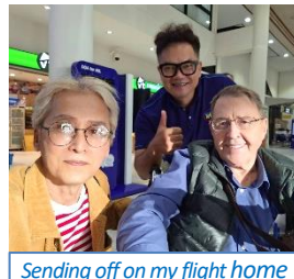
Sending off on my flight home